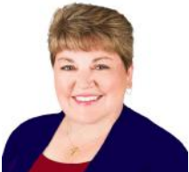
Mayor Julie Maas-Kusske